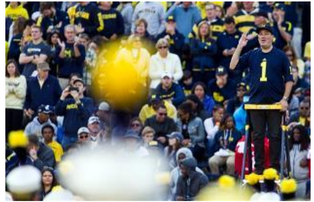
Maestro Alan Gilbert conducts the combined bands Homecoming 2015

other community interactions. With great good fortune, it turned out that the date for this historic event was homecoming weekend. Then, someone had an idea. Would there be any interest in