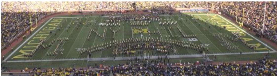
The Michigan Marching Band, Alumni Band, UMS Choral Union, SMTD Brass Studios and the New York Philharmonic Brass Homecoming 2015

The University Musical Society (UMS) in conjunction with the School of Music, Theatre and Dance was developing a plan to bring the New York Philharmonic (NYP) to Ann Arbor as an "orchestra in residence". As such, a series of concerts was planned along with master classes and