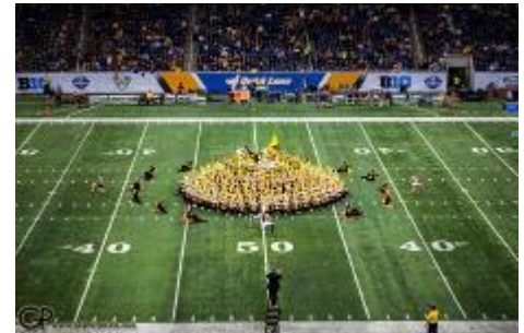
Minnesota’s “Birthday Cake” on Ford Field—Quick Lane Bowl