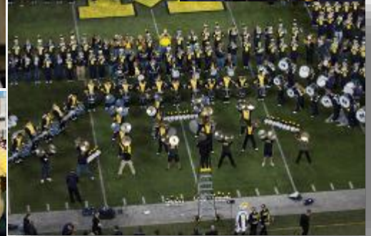
Scenes From A Special Day