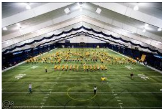
University of Minnesota Marching Band in rehearsal at Oosterbaan Field House

After watching what looked like an extremely difficult rehearsal I was invited to sing their alma mater and they gave me a Pride of Minnesota baseball cap to match theirs! I had a great time connecting with their Director of Bands, their directors, drum major, and other members. They were excellent guests in Oosterbaan and were so much fun to be around, making it a day I will be sure to remember.