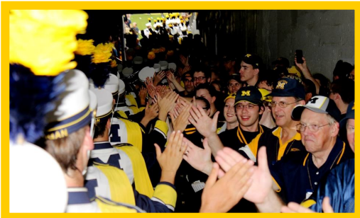
IN THE TUNNEL WITH ALUMNI BAND- BLAST 2013