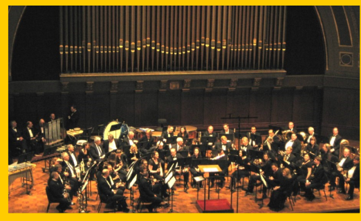
UMBAA CONCERT BAND ON STAGE AT HILL AUDITORIUM

The University of Michigan Band Alumni Association Concert Band is a volunteer organization committed to finding a place for University of Michigan Band Alumni of all ages and abilities to gather, make music and socialize. Formed in the spring of 2009, the UMBAA Concert Band continues to provide an opportunity for alumni to continue displaying their musical excellence and tradition of the University of Michigan.