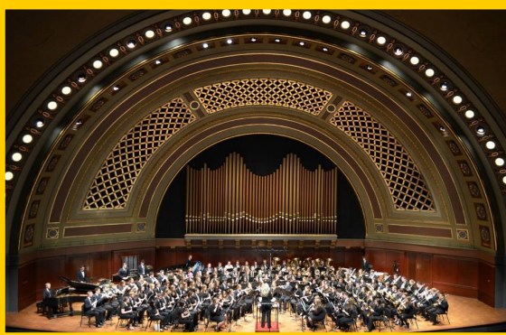
ANDREA BROWN CONDUCTS THE COMBINED MAIZE AND BLUE CAMPUS BANDS AT HILL APRIL 4