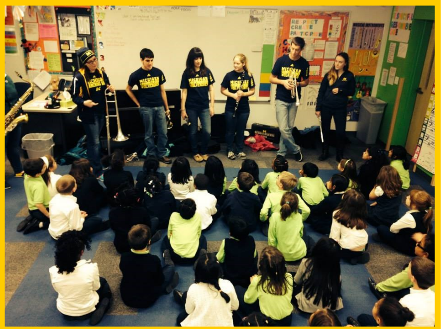
MICHIGAN MARCHING BAND MEMBERS TEACH 2ND GRADE STUDENTS ABOUT INSTRUMENTS AT YPSILANTI'S SOUTH POINTE SCHOLARS ACADEMY, DECEMBER 2013