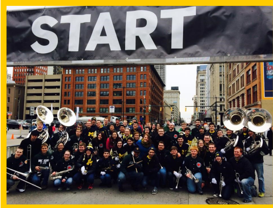
INDIANAPOLIS: COMBINED MMB AND SPARTAN BAND PERFORMANCE AT THE B1G 10K MARCH 14