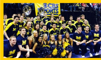
BASKETBALL BAND AT B1G CHAMPIONSHIP