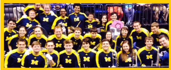
MICHIGAN BASKETBALL BAND AT 2014 NCAA ROUND OF 16, MARCH 28