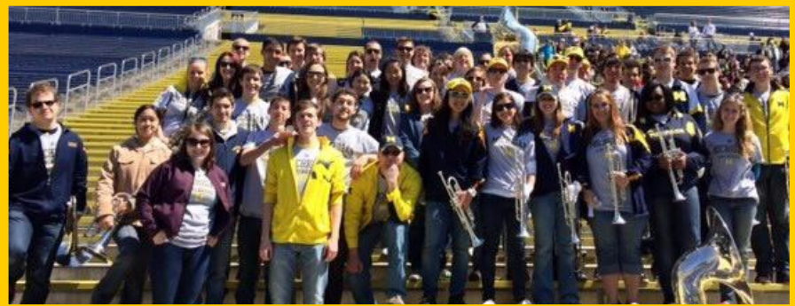
MICHIGAN BAND AT THE BIG HOUSE FOR THE FIRST GAME FOR MICHIGAN WOMEN'S LACROSSE TEAM #1 ON APRIL 5