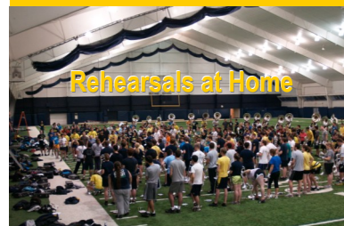
Rehearsals at Home