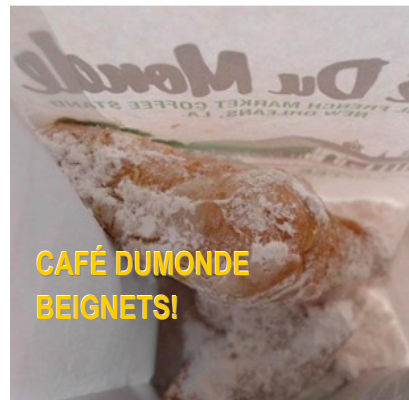
CAFÉ DUMONDE BEIGNETS!

ultimately my favorite activity, though.