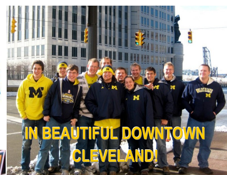
IN BEAUTIFUL DOWNTOWN CLEVELAND!