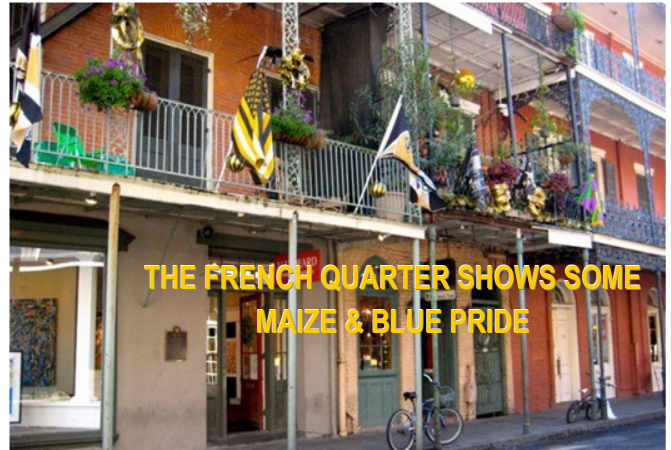
THE FRENCH QUARTER SHOWS SOME MAIZE & BLUE PRIDE

As far as tourist attractions in New Orleans, it wasn't as much about specific monuments or buildings, but rather an overall feeling created by streets filled with breathtaking architecture and jazz music that made it easy to understand why the city's nicknamed The Big Easy . We took a steamboat cruise, and I went to the aquarium and took a trolley ride on my own time. Strolling the French Quarter was