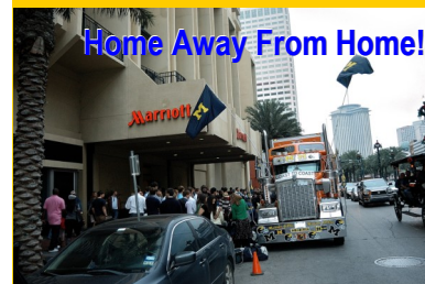
Home Away From Home!