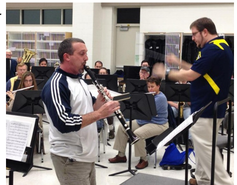
2011 UMBAA Concert Band in Rehearsal at Skyline High School, Ann Arbor