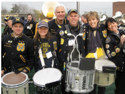
Left: The 1981 Rose Bowl Line back for their 30th reunion.