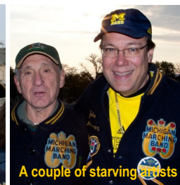
A couple of starving artists