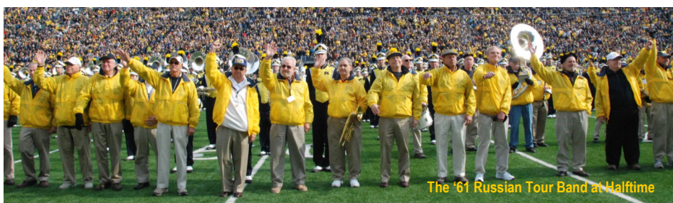
The '61 Russian Tour Band at Halftime