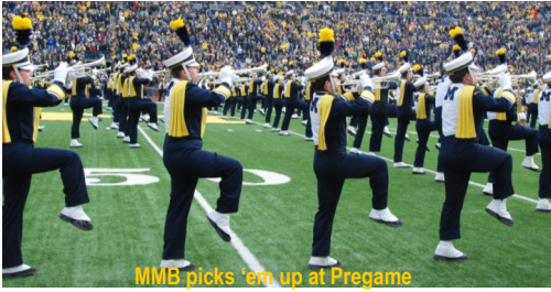
MMB picks 'em up at Pregame