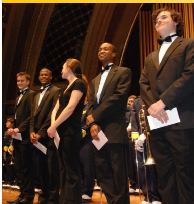
2011 UMBAA Scholarship Recipients Symphony and Concert Bands

The website requires users to be logged in before seeing the Membership and Concert Band forms. If you are not sure what email address we have for you or have any problems creating a login, send an email to umbaa-webmaster@umich.edu including what band(s) you played in while at UM, your first year in the band, and the name you used when in the band.