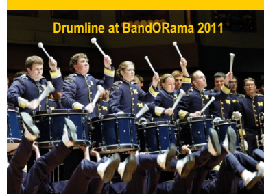
Drumline at BandORama 2011