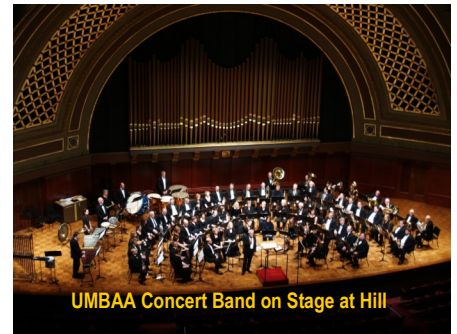
UMBAA Concert Band on Stage at Hill