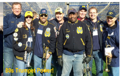
80s Trumpet Power!