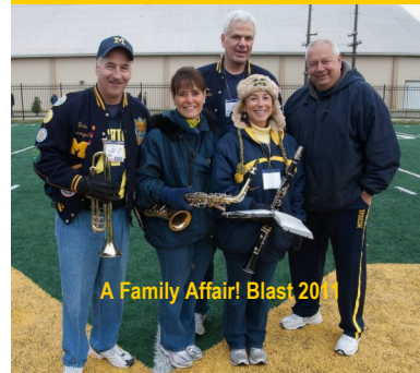
A Family Affair! Blast 2011