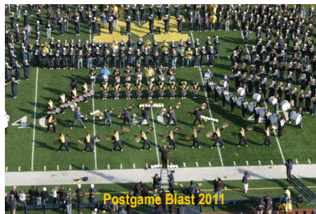
Postgame Blast 2011