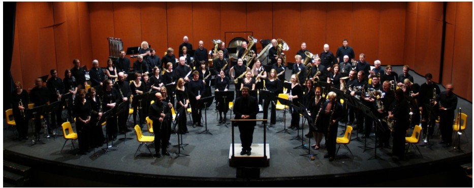
UMBAA Concert Band performs at Ann Arbor Huron HS in November