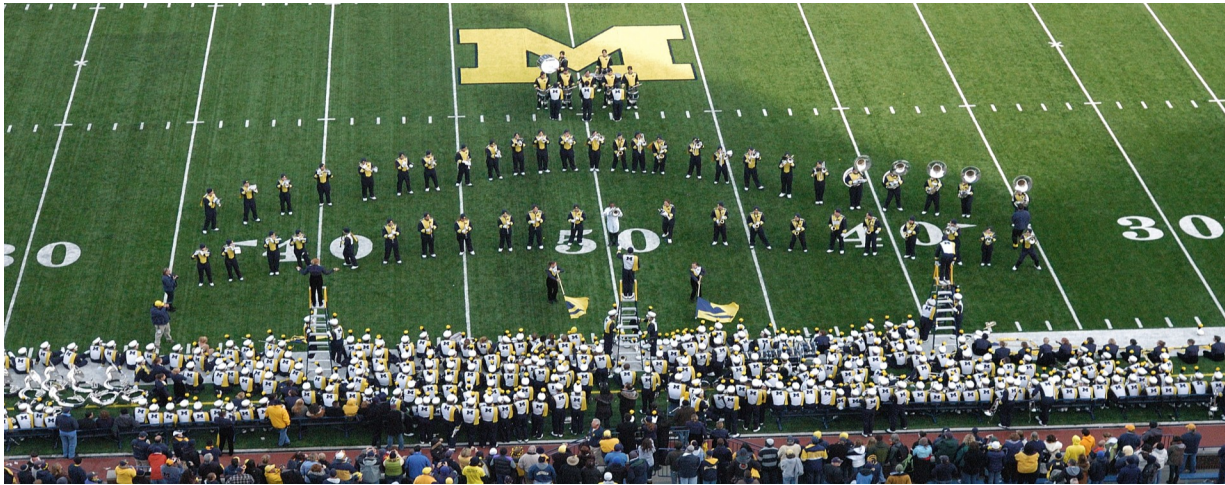
The MMB Senior Class performs one final show in The Big House at the close of the Wisconsin game.