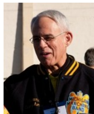
UMBAA PAST PRESIDENT