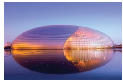
BEIJING CENTER FOR THE PERFORMING ARTS

The University of Michigan Band Alumni wish the Symphony Band all the best for a memorable and musical tour.