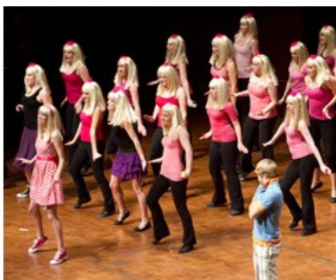
MEMBERS OF THE MMB PERFORM THEIR WINNING ENTRY IN 2011 MICHIGAN MOCK ROCK.