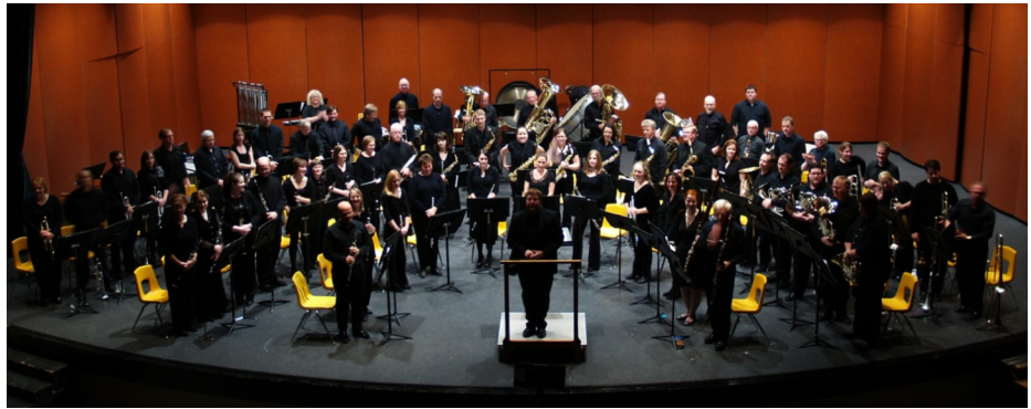
UMBAA Concert Band performs at Ann Arbor Huron HS on June 12