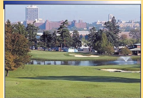
UM GOLF COURSE

2009 UMBAA GOLF OUTING SUNDAY, AUGUST 2, 2009 INFORMATION: Email umbaa-golf@umich.edu