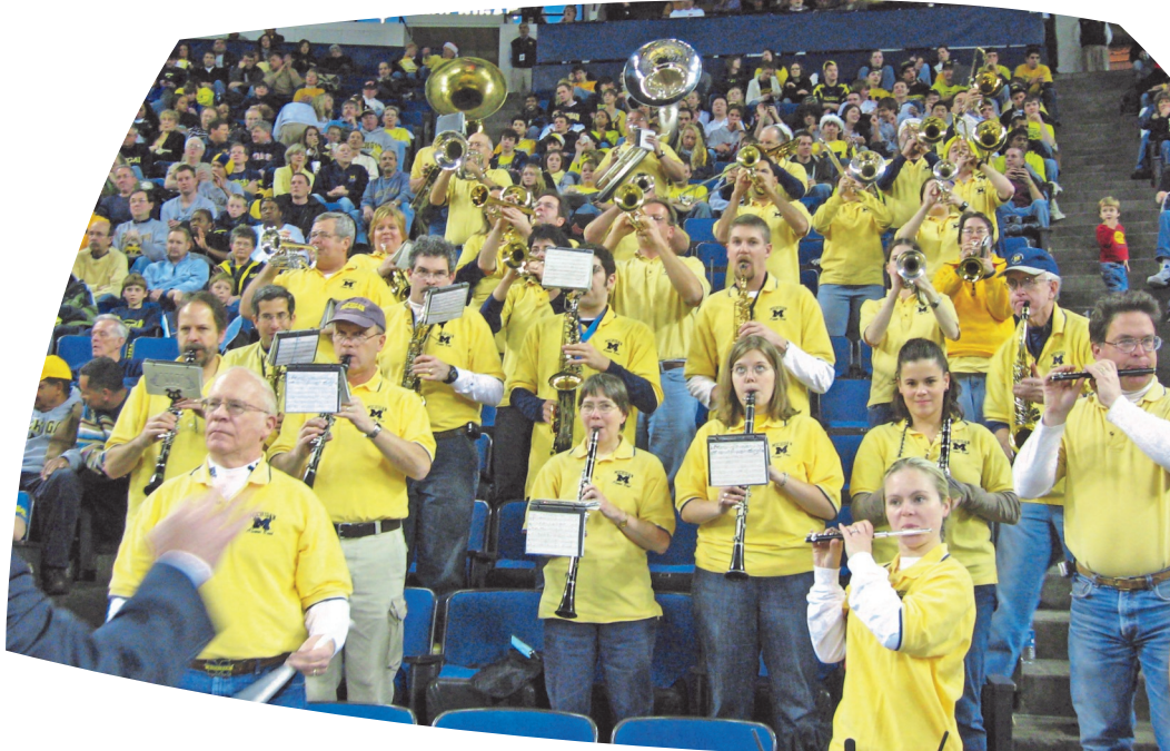
Members of the 2008-09 Ann Arbor Area University of Michigan Alumni Pep Band perform at a Michigan Basketball Game.