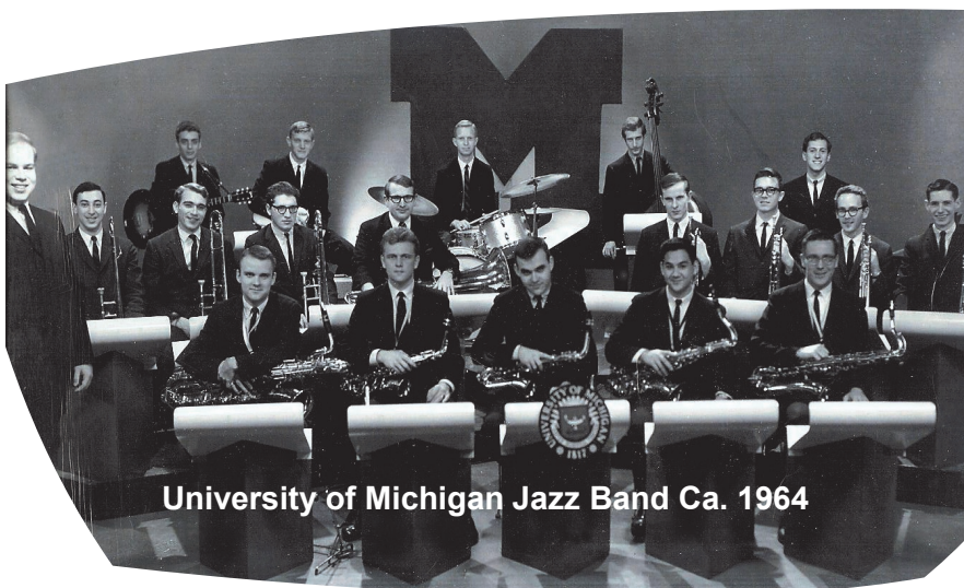
University of Michigan Jazz Band Ca. 1964