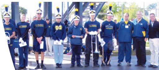
2008 UMBAA Scholarship Recipients

For every $10,000 added to our endowment fund, UMBAA can fund another scholarship to a deserving student members of ALL of the Michigan Bands.