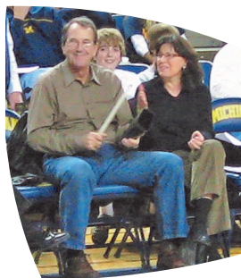
Coach Carr accompanies the Alumni Pep Band