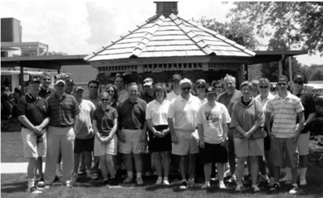
Pictured Above: All Participants